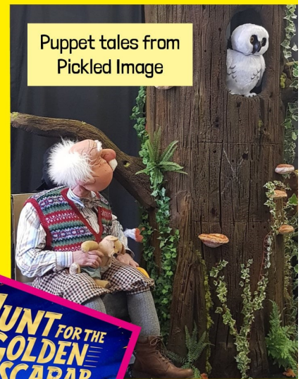
Puppet tales from Pickled Image